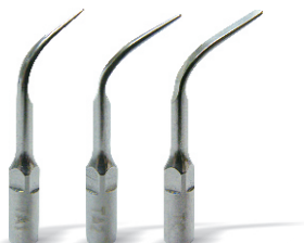
TA1 TA2 TC